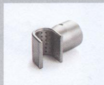
Sieve reflector, 35 x 20 mm Article No: 107.338