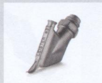
Drawing nozzle without tacking tip, Ø 3 mm Article No: 113.876