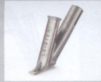
Speed welding nozzle, triangular shaped, 7 mm * Article No: 106.993