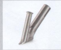
Speed welding nozzle Ø 3 mm * Article No: 106.989