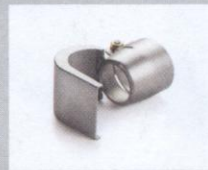
Spoon reflector, 27 x 35 mm Article No: 107.307