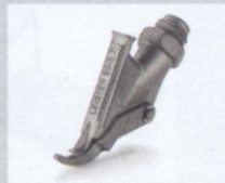
Drawing nozzle with tacking tip, triangular shaped 5.7 mm Article No: 113.670