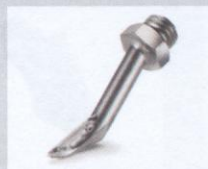
Tacking nozzle Article No: 106.988