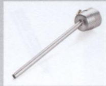
Extension nozzle Ø 5 mm, 150 mm Article No: 106.982