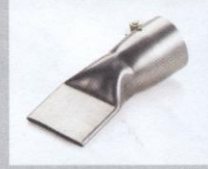
Wide slot nozzle 40 mm Article No: 107.132