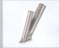
Speed welding nozzle Ø 4 mm * Article No: 106.990