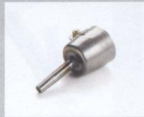
Tubular nozzle Ø 5 mm, reinforced Article No: 105.578