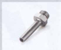
Tubular nozzle Ø 5 mm Article No: 105.622