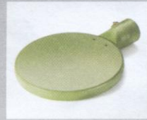
Welding mirror 135 mm, PTFE coated Article No: 107.344