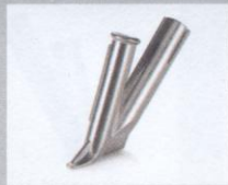
Speed welding nozzle Ø 5 mm * Article No: 106.991