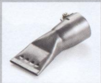
Wide slot nozzle 40 mm, perforated Article No: 107.133