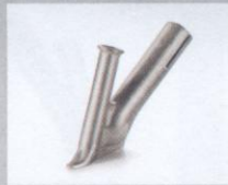
Speed welding nozzle, with small air-slide, Ø 3 mm * Article No: 105.431