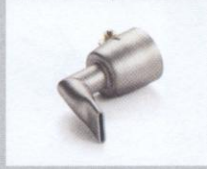
Angled nozzle 20 mm, 90° bent Article No: 107.124