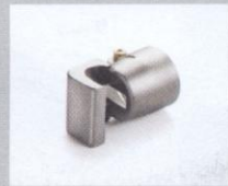
Soldering reflector, 17 x 34 mm Article No: 107.339