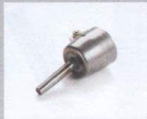
Tubular nozzle Ø 5 mm Article No: 100.303