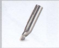
Tacking nozzle * Article No: 106.996