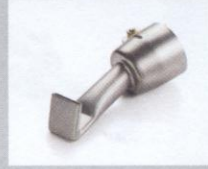
Wide slot nozzle 20 mm, straight jaw, 120° bent at right angle Article No: 105.492