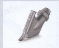
Drawing nozzle without tacking tip, Ø 4 mm Article No: 113.874