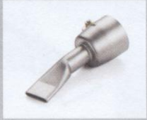
Wide slot nozzle 20 mm, bent, not angled Article No: 107.123