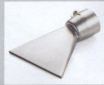
Wide slot nozzle 80 mm, for bitumen Article No: 107.131