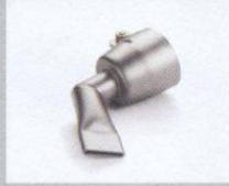
Angled nozzle 20 mm, 60° bent Article No: 107.125