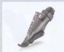
Drawing nozzle with tacking tip, Ø 3 mm Article No: 113.666