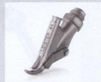
Drawing nozzle with tacking tip, Ø 4 mm Article No: 113.399