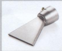
Wide slot nozzle 60 mm, for bitumen Article No: 107.129