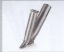
Speed welding nozzle, with small air-slide, Ø 5 mm * Article No: 105.433