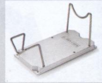
Tool rest TRIAC Article No: 107.348