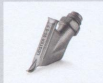
Drawing nozzle without tacking tip, triangular shaped 5.7 mm Article No: 113.877