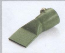
Wide slot nozzle 40 mm, PTFE coated Article No: 107.135