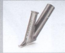
Speed welding nozzle, triangular shaped, 5.7 mm * Article No: 106.992