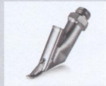
Drawing nozzle, triangular shaped 7 mm Article No: 106.986