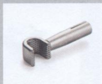
Sieve reflector (Ø 8.25 mm), 10 x 12 mm * Article No: 107.324