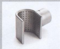
Sieve reflector, 50 x 35 mm Article No: 107.337