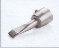
Wide slot nozzle 20 mm, bent and angled Article No: 105.487