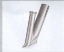
Speed welding nozzle, with small air-slide, Ø 4 mm * Article No: 105.432